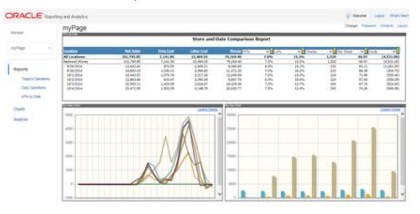
Figure 1. Easy-to-read dashboards display key trends in your F&B establishment.

Oracle Hospitality Reporting and Analytics Advanced Cloud Service is a powerful, centralized web-delivered reporting platform. It delivers a single point of access to BI that helps F&B operators increase revenue and profits. With it, getting access to your data has never been easier. Key transaction data can easily be sent to secure locations on a dependable and scheduled basis, enabling Oracle Hospitality Reporting and Analytics Advanced Cloud Service to maintain the centralized system of record for downstream systems.