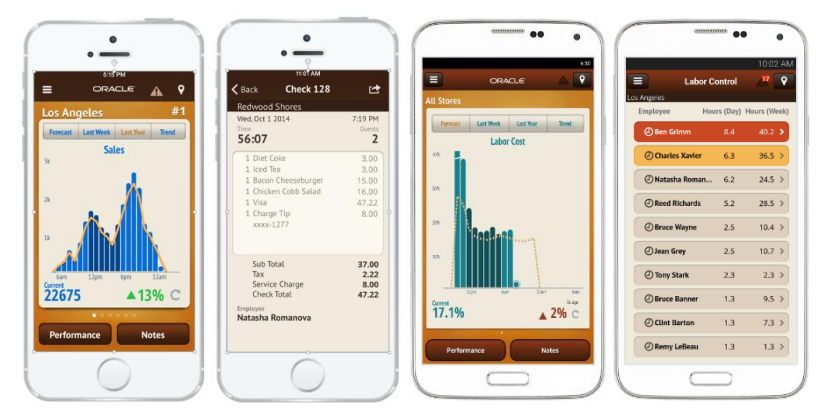
Figure 2. inMotion provides dashboards of KPIs on your smartphone.

compare it to forecast, the same day last week, or the same day last year. If KPIs such as labor cost, void percentage, or discounts exceed projected thresholds, inMotion provides real-time alerts. Hotel managers and owners using Oracle Hospitality OPERA Property Cloud Service can also use inMotion to access data on arrivals, departures, and housekeeping.